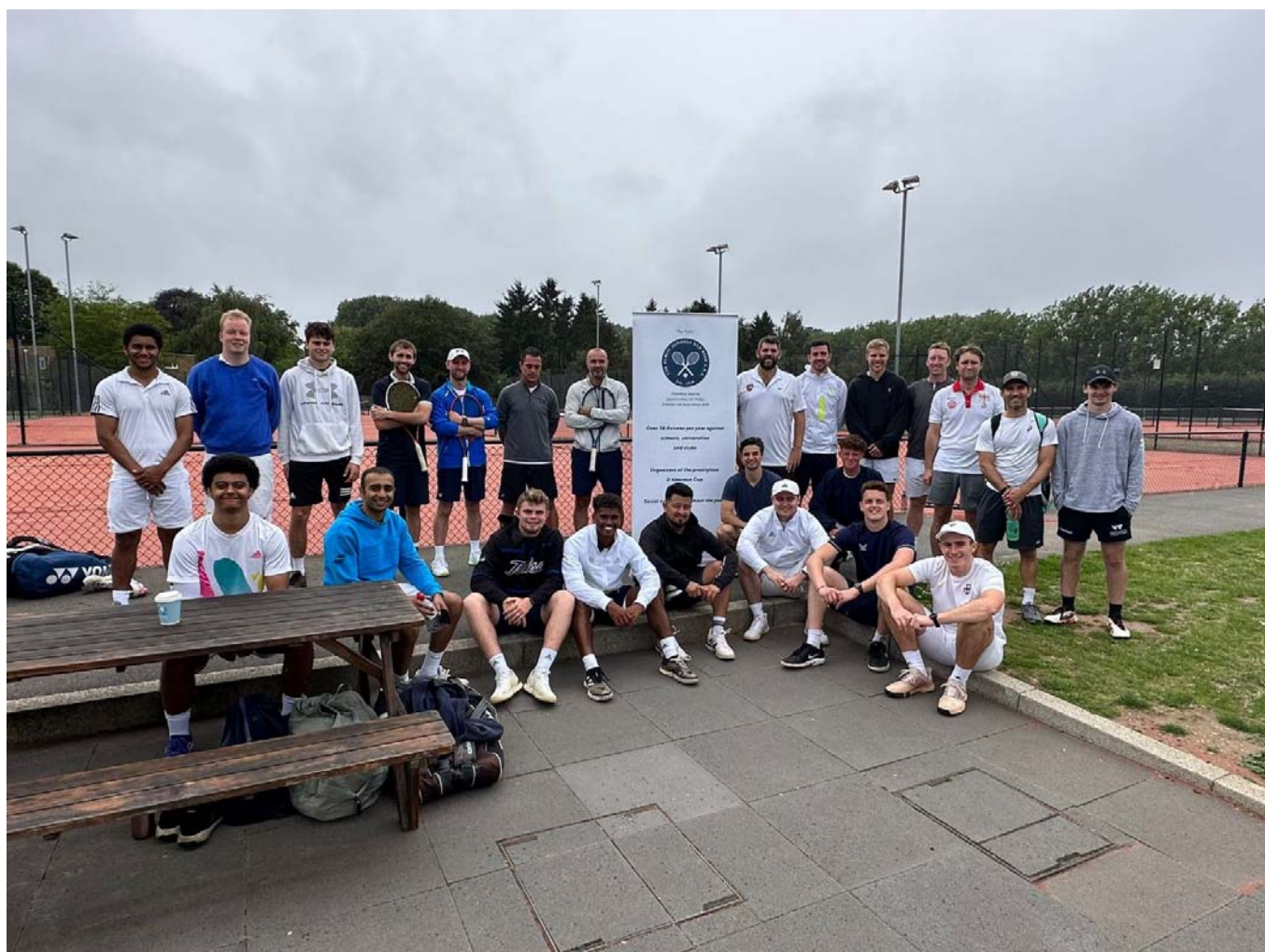
Knockout day - at Eton College

However, every team and player that turned up played through the inclement weather and after a very long (and wet) day of tennis, Old Reptonians qualified for the final, and unbelievably a shootout was required to secure a place in the final for the Old Georgians (against the Old Reptonians), for their second time as finalists in the history of the competition.