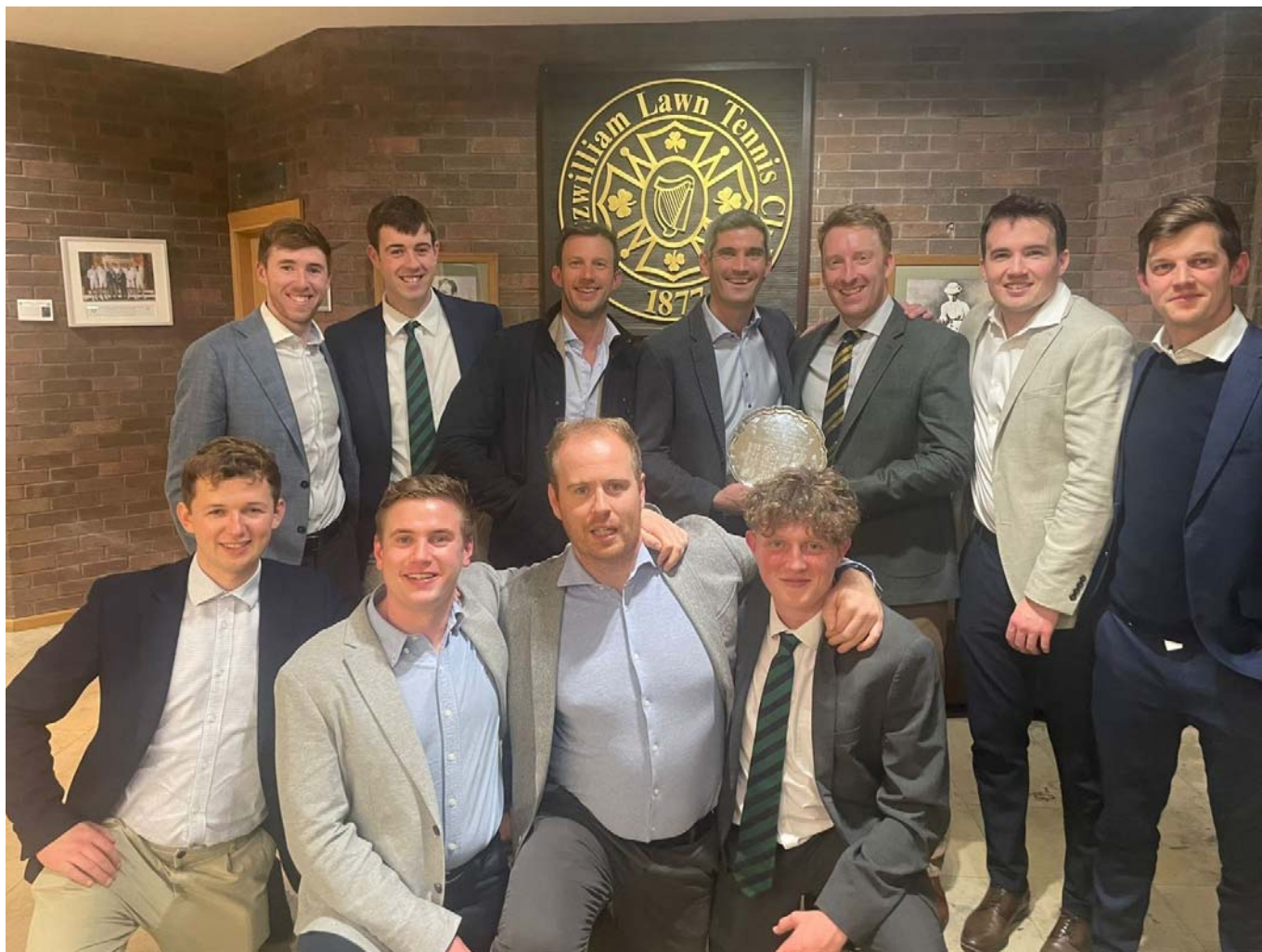
PUBS vs Fitzwilliam LTC

The first fixture of this year was the annual match against Fitzwilliam LTC in Dublin, playing for the Courtney Salver. The fixture is always entertaining both on and off the court and this year certainly lived up to that, with the fixture taking place over the St. Patrick's Day weekend!