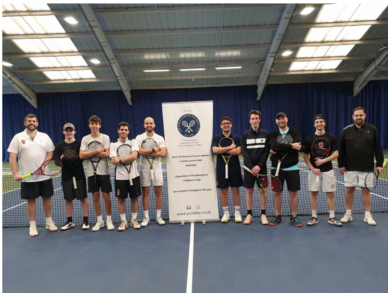
Qualifying - at St George's College

Once again, we thank St George's College and Reed's School for allowing the qualifying events to be held at their respective facilities in early April.