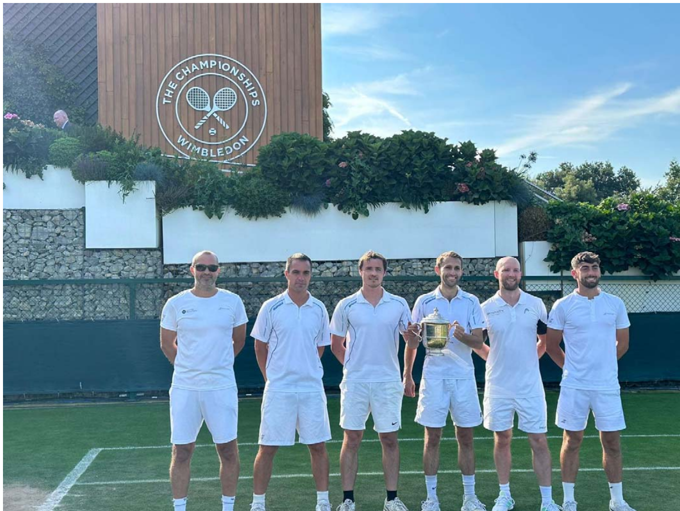
2023 D'Abernon Cup Winners - Old Reptonians