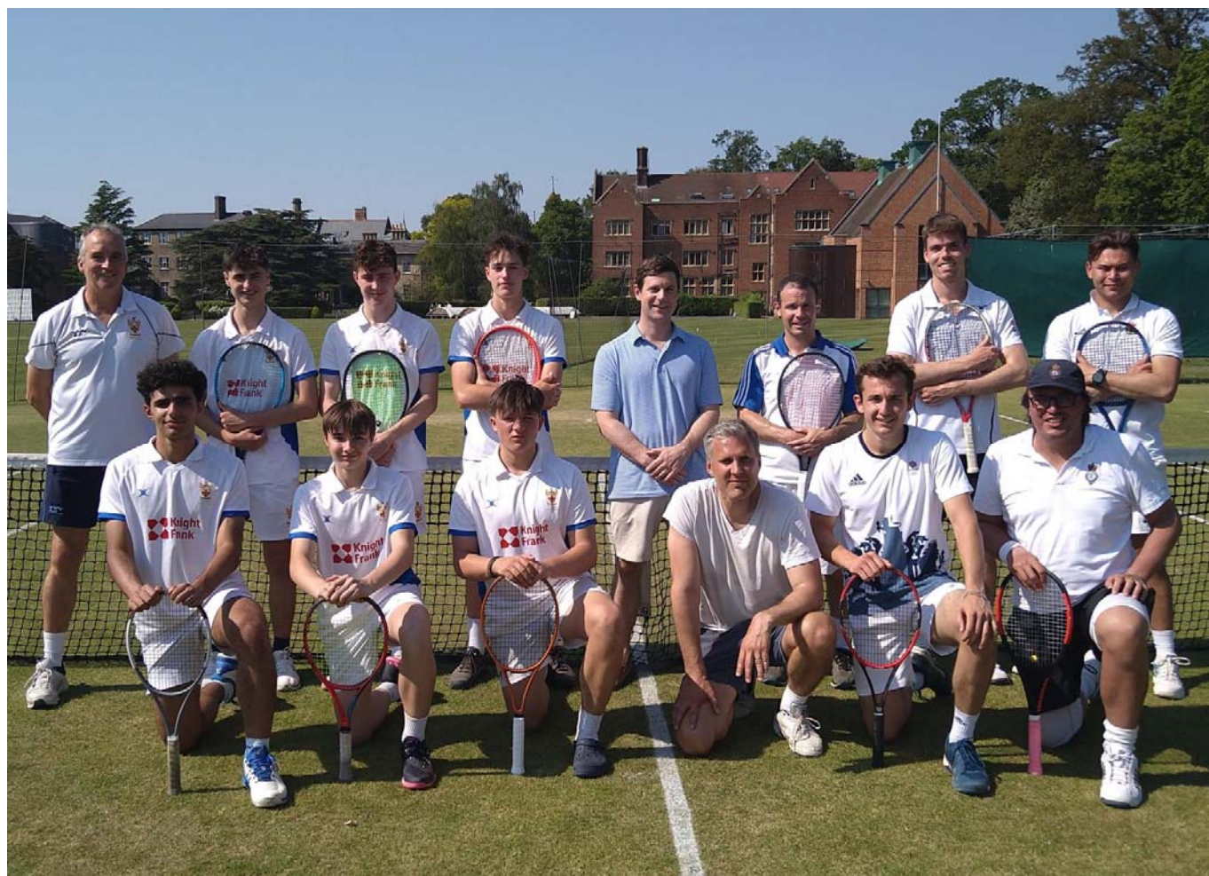
PUBS vs The Leys School

By half-way through the season, the tally stood at eight wins, one draw and four losses.