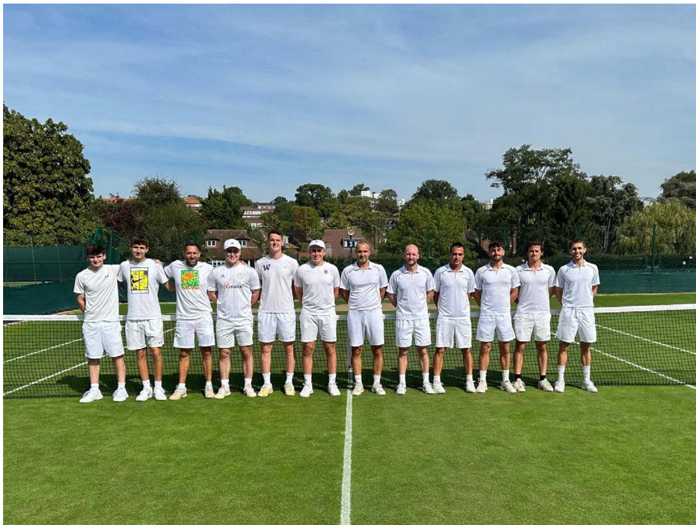
The Finalists - Old Georgians and Old Reptonians

The first round of matches set the tone for the rest of the tie with some highly competitive play and the Old Reptonians edging it 2-1. This continued in the second round when opposite numbered pairs played each other and the Old Reptonians established a 4-2 lead having crucially won two of the three rubbers in this round.