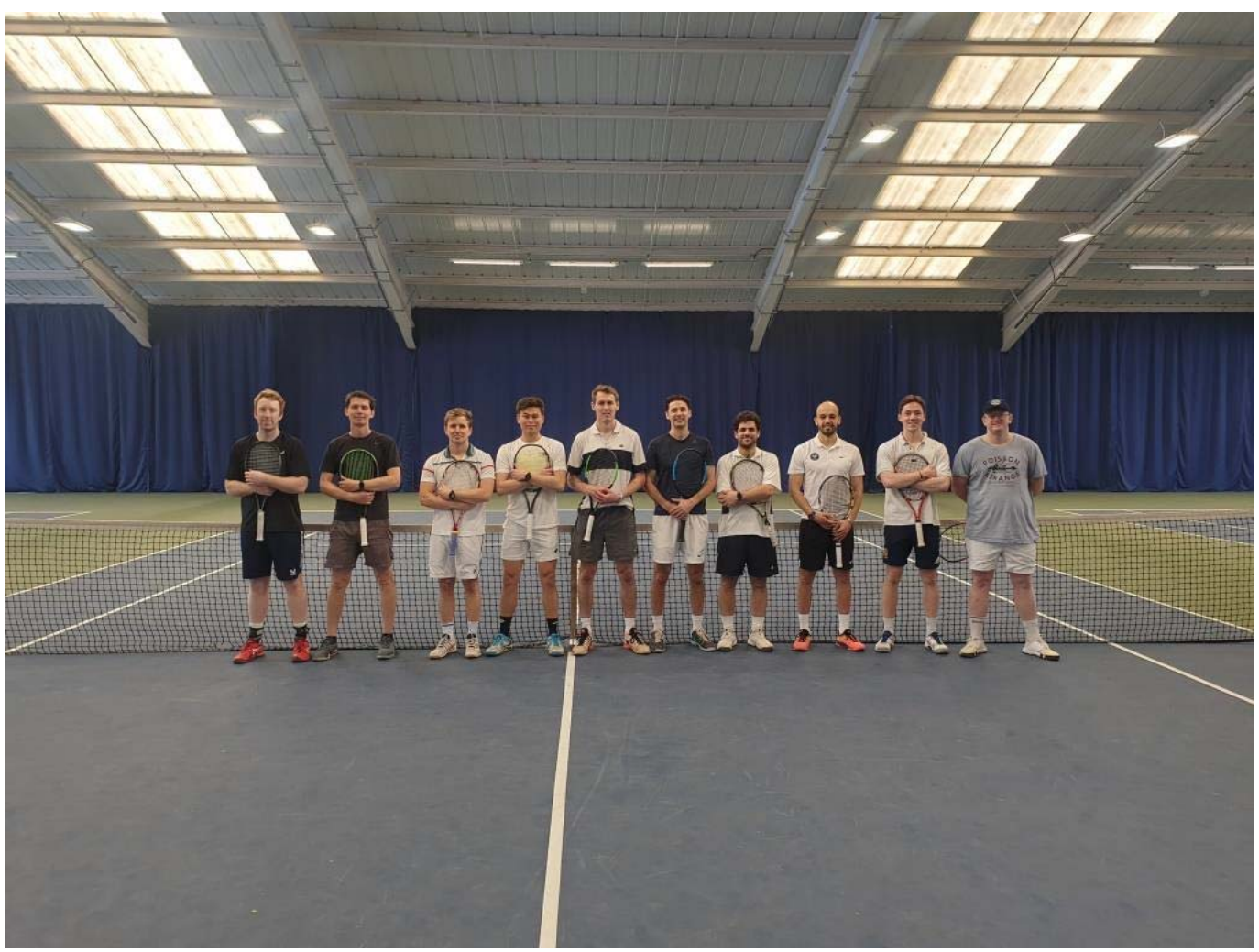
Qualifying - at St George's College

Qualifying again welcomed some familiar faces, and qualifying events were held at Reed's School and St George's College in April.