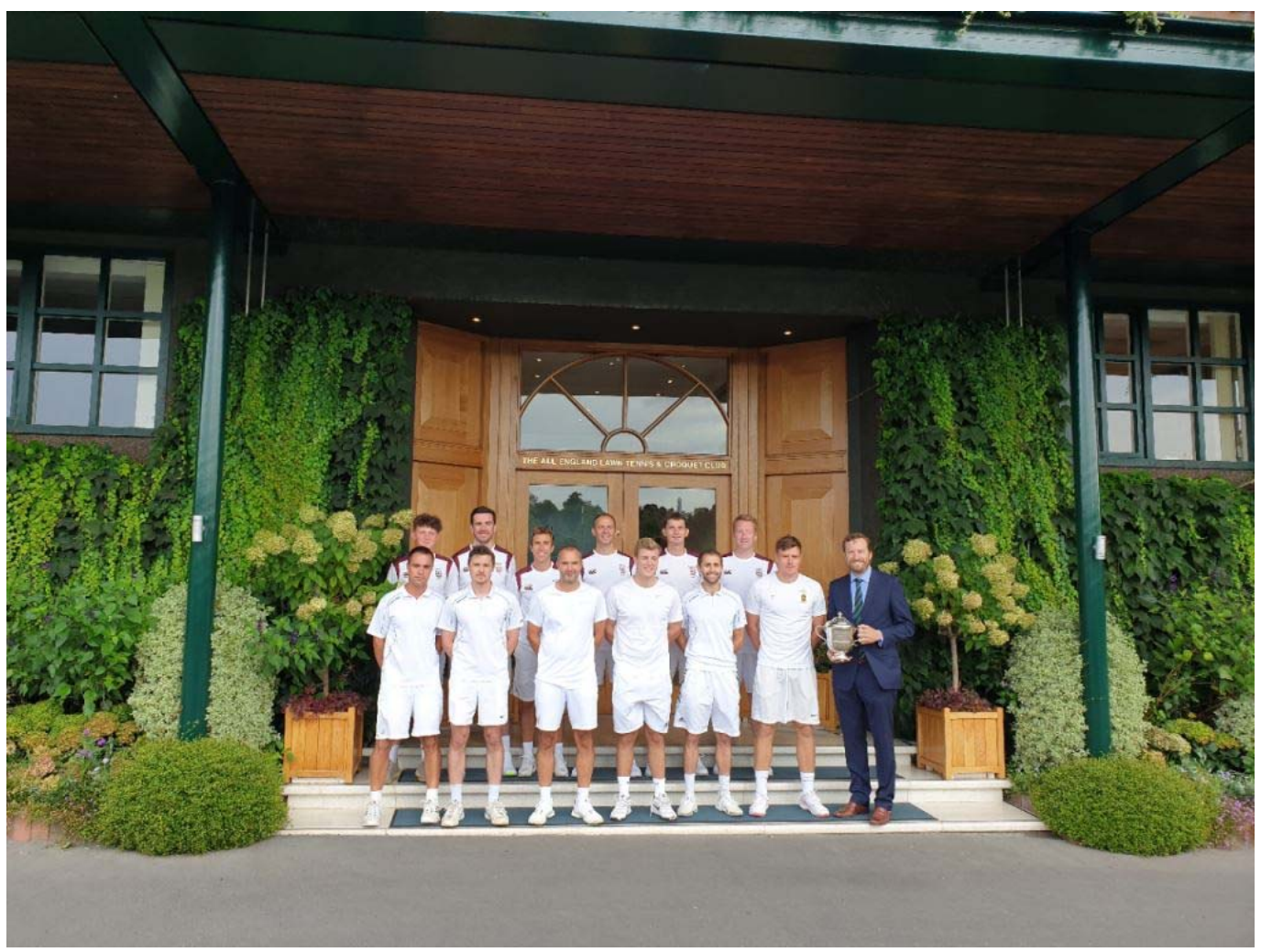
Finalists - Old Reptonians and Old Bromsgrovians

Defending champions Old Reptonians took on the Old Bromsgrovians in the final of the 2022 D'Abernon Cup. Hosted by the AELTC and played on the beautiful grass courts of Aorangi the day started in good spirits with a splendid breakfast. After the requisite photoshoot the tennis commenced with both teams looking sharp.