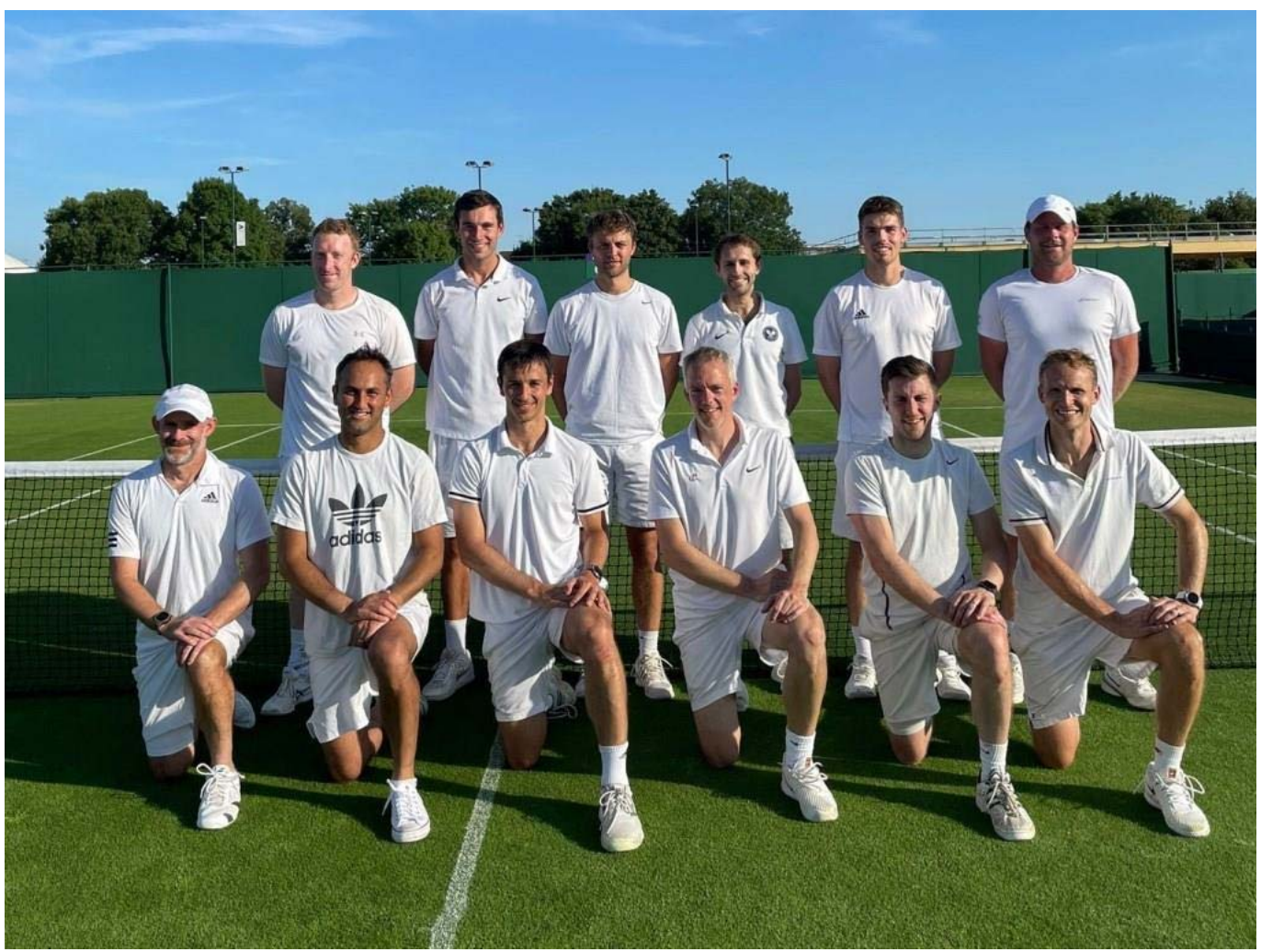
PUBS vs IC of GB

The PUBS vs IC of GB match, always one of the highlights of the calendar took place on the pristine Grass courts at the All England Club community ground in July with the PUBS sneaking a closely fought 6-3 victory.