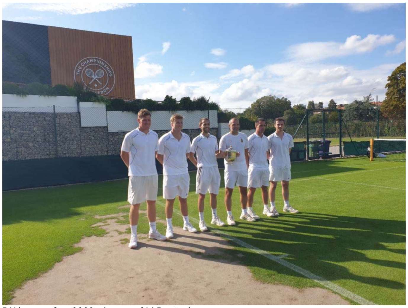
D'Abernon Cup 2022 winners - Old Reptonians

Completion of the day's events included a delicious match tea for the players and their guests and many thanks to the AELTC for hosting the match and for looking after us all so well.