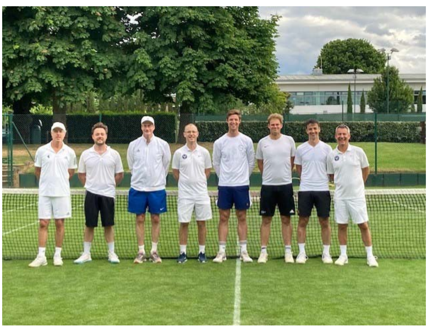
PUBS vs Roehampton

The medicine must have worked as wins against Reed's and the Leys School followed in quick succession in April.