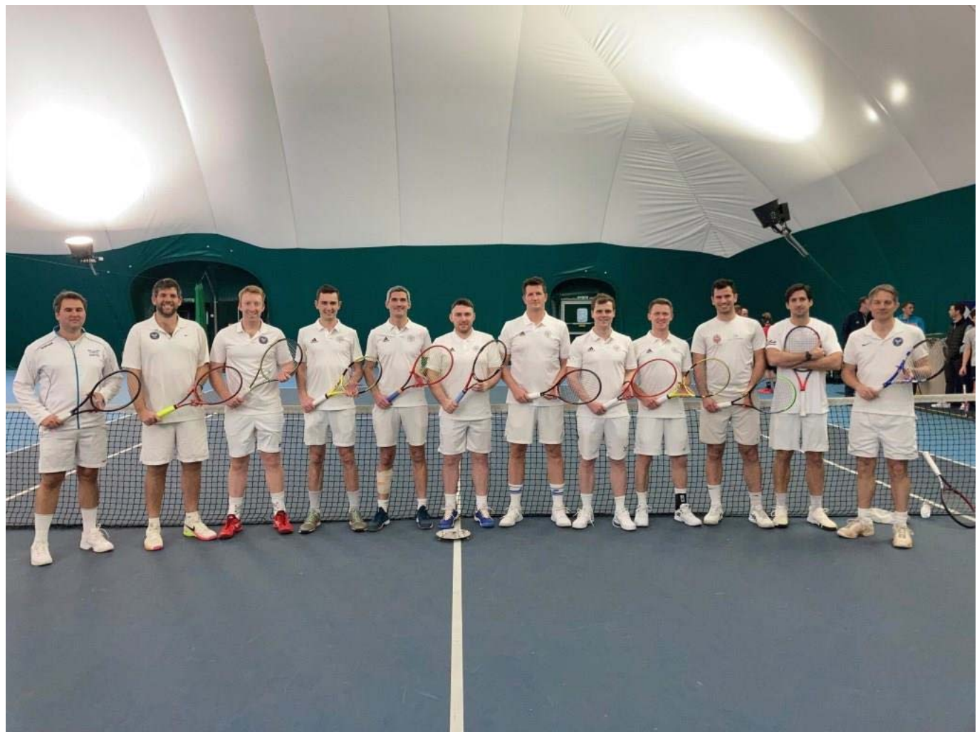
PUBS vs Fitzwilliam LTC

The Courtney Salver match kicked off the season in March as we played host to Fitzwilliam LTC at Reed's.