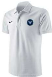
PSOBLTA Nike Dri-Fit Tennis Shirt £38.95