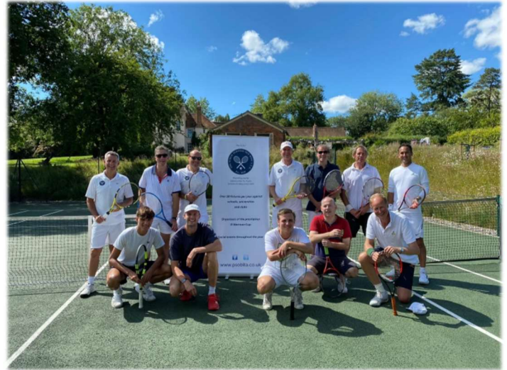
PSOBLTA v Ashmansworth