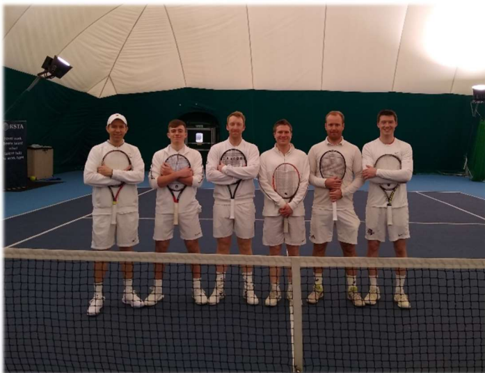
PSOBLTA team photo v Fitzwilliam LTC