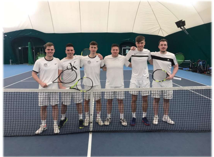
Fitzwilliam LTC team photo