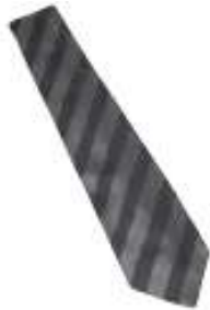
Association ties (silk) £15.00

The following Association merchandise is available: