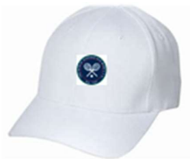
PSOBLTA cap £15.00