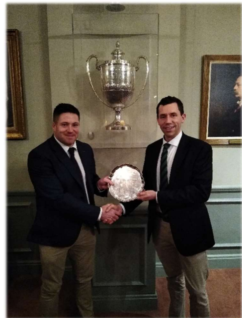
Trophy presentation at The Queen's Club