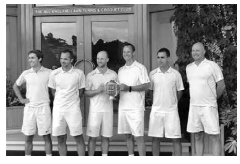
D'Abernon Cup winners - Old Reptonians

With the growing number of entrants and the ongoing success of having three qualifying events, we will continue this format for the 2018 D'Abernon Cup whereby the prior year finalists will automatically qualify to the quarter-finals along with the winners and runners-up from each qualifying event. The three qualifying round robin days for this year's competition will take place on Saturday, 7th April (St. George's College), Saturday, 14th April (Stoke Park) and Sunday, 22nd April (David Lloyd Raynes Park).