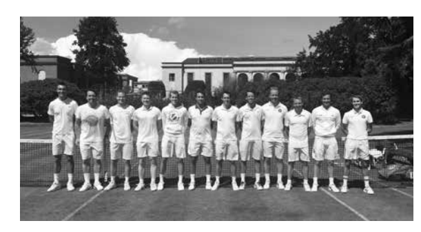
PSOBLTA v IC.

Once again, the International Club (IC) saw a close tie going narrowly to the IC as they won 5-4. It wasn't the only tight match where we were just edged out – St George's Hill LTC, Ashmansworth, Ealing LTC and Felsted School were extremely close ties where we just fell short of securing a result.