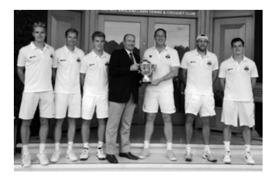
D'Abernon Cup winners – Old Reedonians

Due to an increasing number of entrants, this year there will be a change in the format of the D'Abernon Cup whereby only the prior year finalists will automatically qualify to the quarter-finals and there will be three qualifying days instead of two. The three qualifying round robin days for this year's competition will take place on Saturday, 9th April (St. George's College), Saturday, 16th April (Stoke Park) and Sunday, 24th April (David Lloyd Raynes Park).