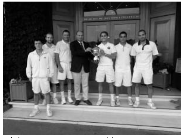
D'Abernon Cup winners – Old Reptonians

The qualifying round robin days for this year's competition will take place on Saturday, 28<sup>th</sup> March (Stoke Park) and Saturday, 11<sup>th</sup> April (St. George's College).